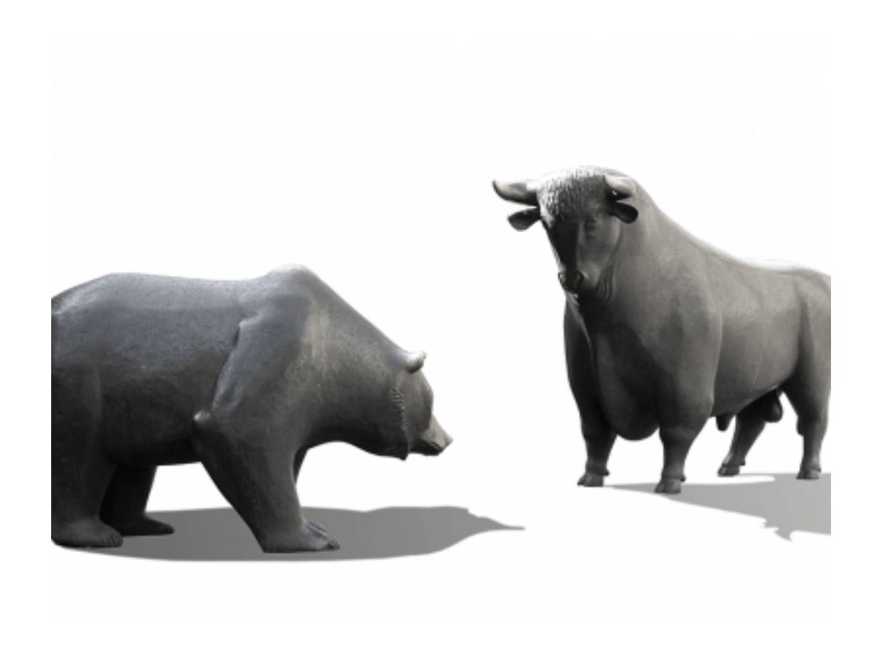
What's Happening in the Market?