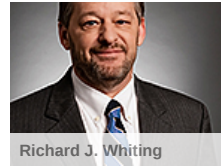
Richard J. Whiting