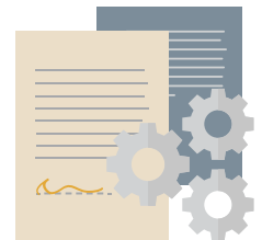
Meeting 4 ENGAGEMENT