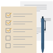
Meeting 1 DISCOVERY