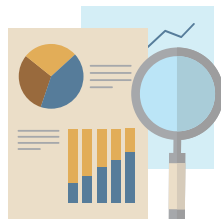
Meeting 2 ANALYSIS