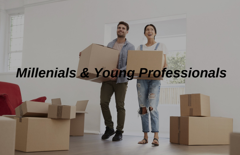
Millenials & Young Professionals

Strategic Partnering (https://www.strat-wealth.com/strategic-partnering/)