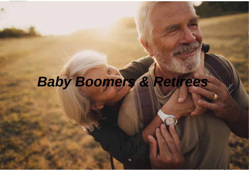
Baby Boomers & Retirees

StratWealth has served the unique needs of an extremely diverse client base for over 25 years. Our team provides comprehensive strategies to serve the determination to serve others to make lives better.