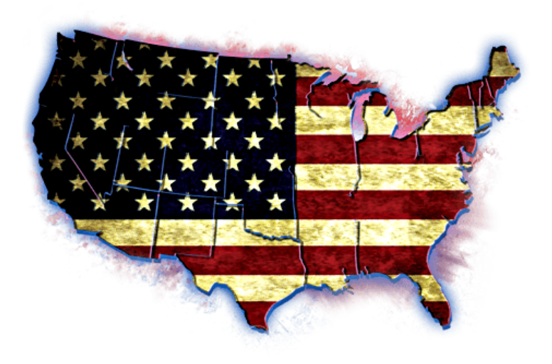
I NEED HELP MOVING TO/LIVING IN THE USA Pathways to the USA