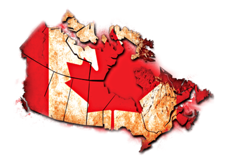
I NEED HELP MOVING TO/LIVING IN CANADA Pathways to Canada

Transition Financial Advisors Group Inc. – Established in 2001