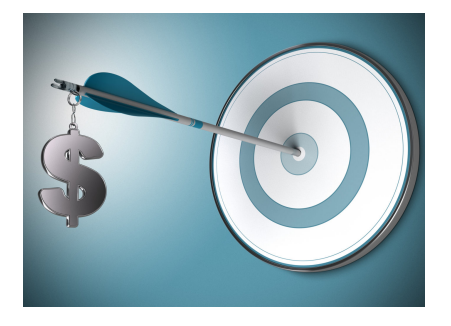
Third Quarter 2018 Client Commentary