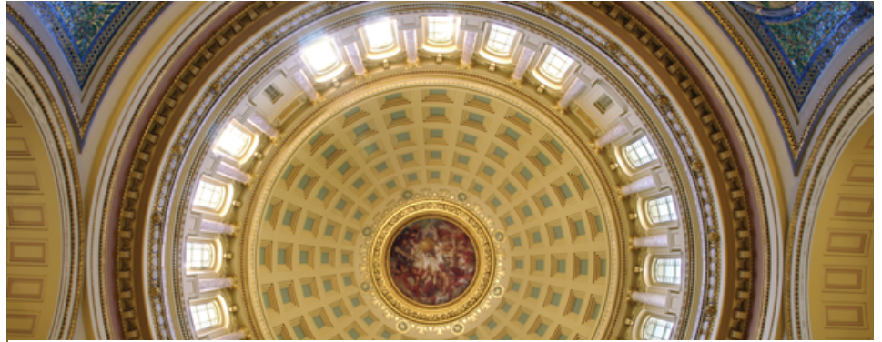
Madison, Wisconsin Capitol Dome