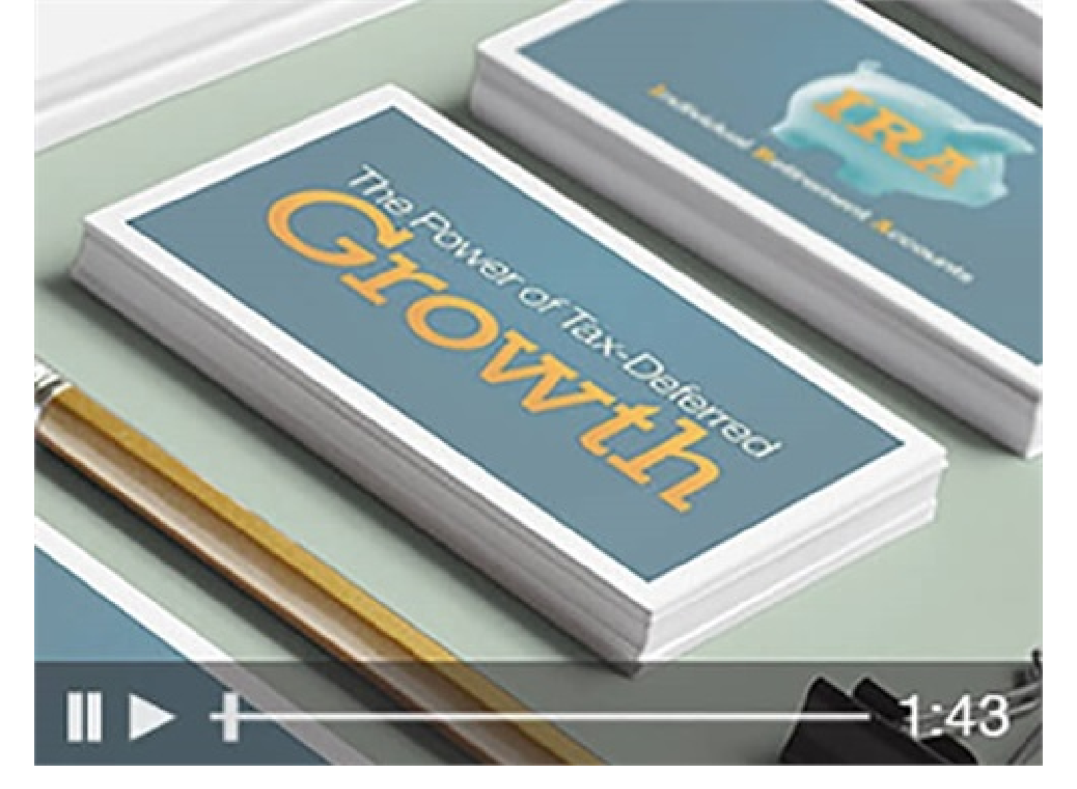
The Power of Tax-Deferred Growth

Why are 401(k) plans, annuities, and IRAs so popular?