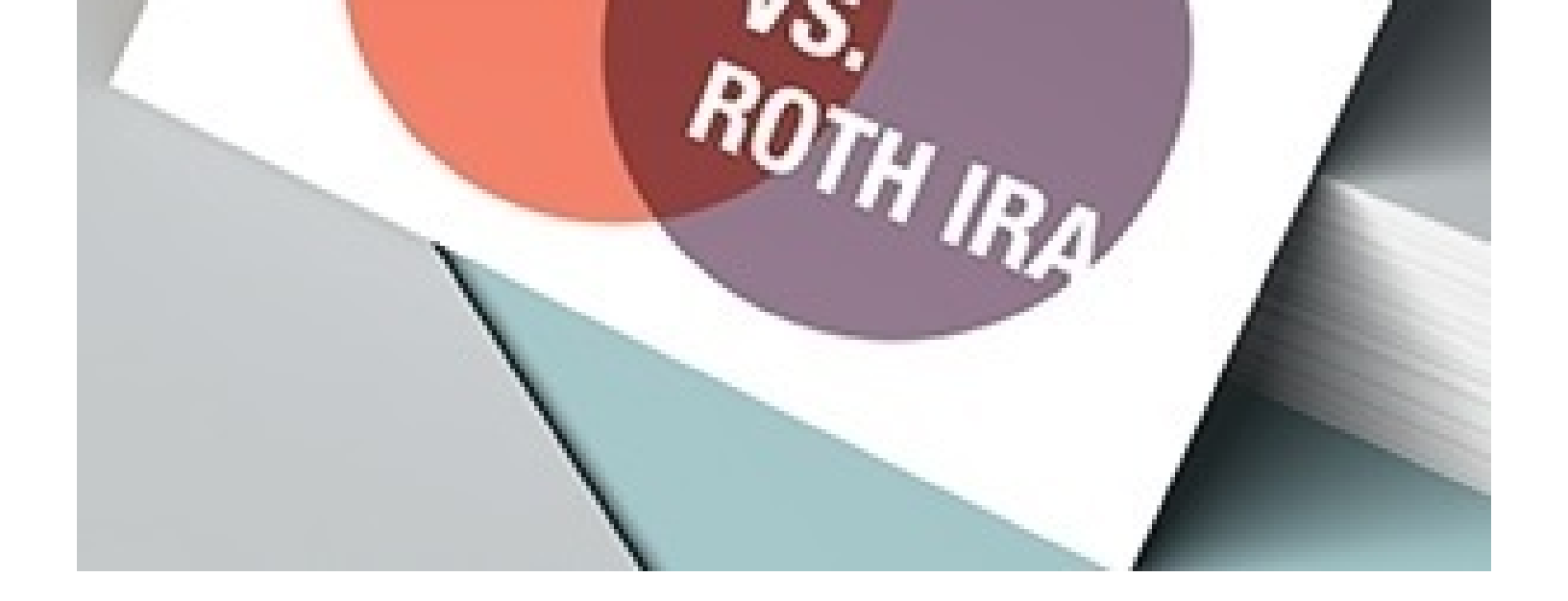
Traditional vs. Roth IRA

One or the other? Perhaps both traditional and Roth IRAs can play a part in your retirement plans.