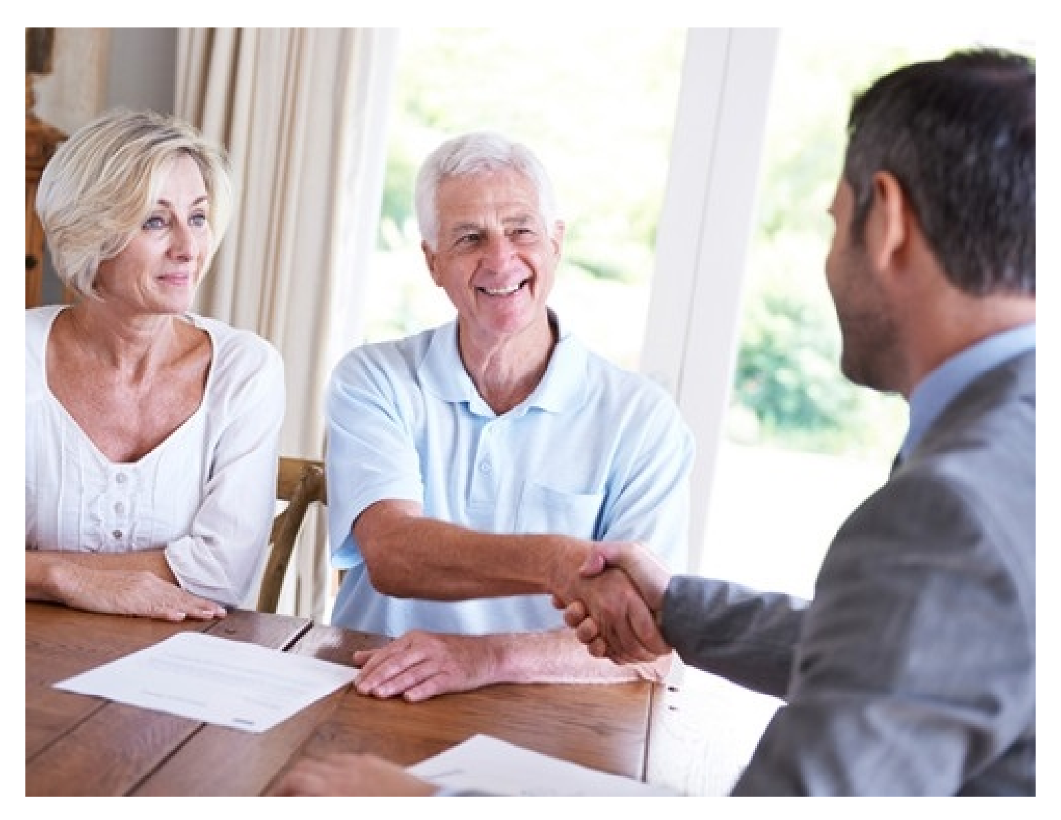
Private Client Process