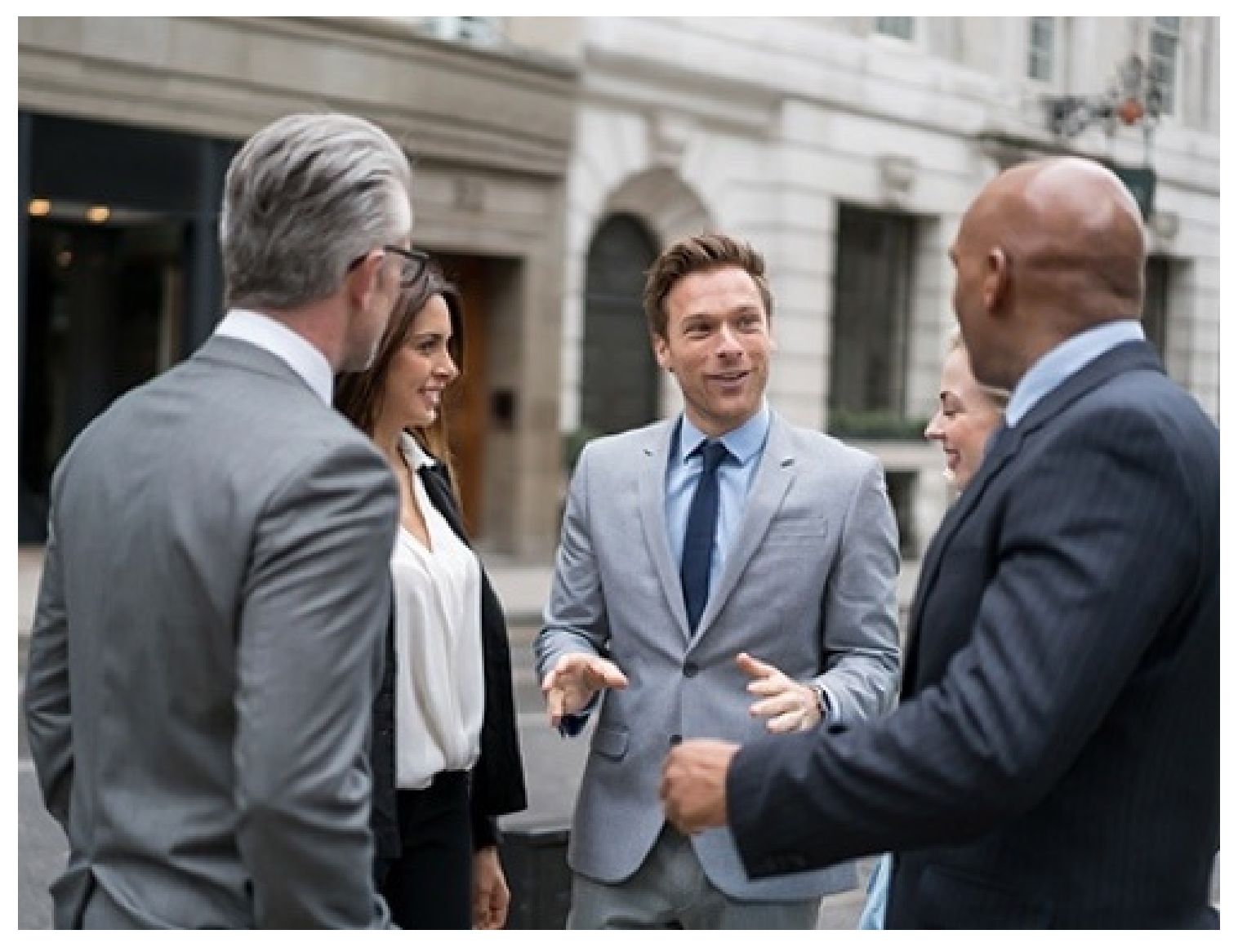
Business Advisory Services