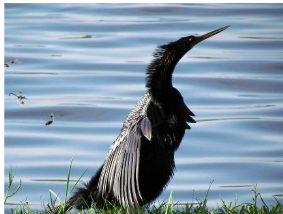
Suncoast nature photos are provided by noted photographer, Dale Goebel, Dunedin, Florida