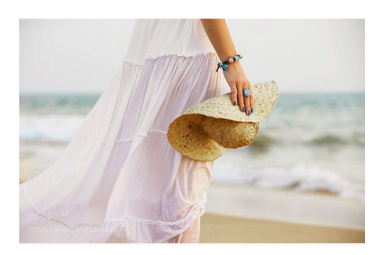
Individuals in Difficult Transitions