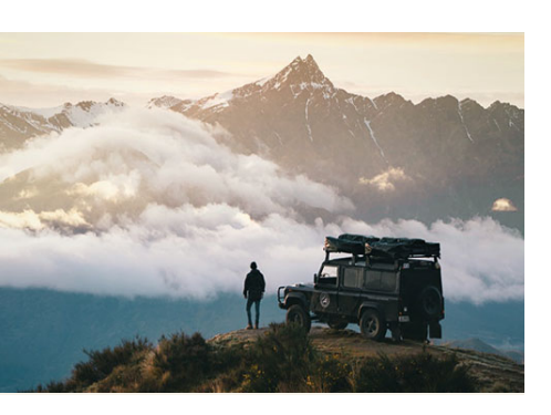
Entrepreneurs, Business Leaders & Retirees

e serve a limited number of financially-established families, primarily in South Orange County, California to elp them navigate the "what's next" in life. It's why each Optivest advisor is truly specialized in serving the sique needs of clients in differing life, wealth and family situations.